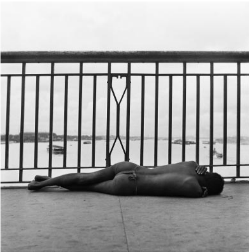
03_Frank Horvat, Howra Bridge, Calcutta, India, 1953