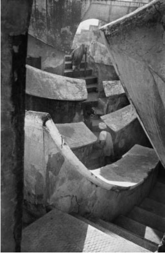
13_ Frank Horvat, Jantar Mantar, New Delhi, India, 1952