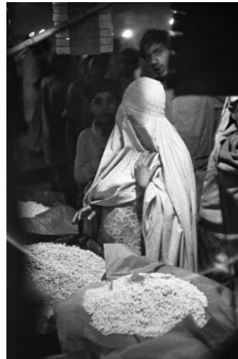
10_ Frank Horvat, Night market, Lahore, Pakistan, 1952