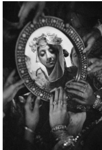
06_Frank Horvat, Husband discovering the face of his wife in a mirror, Lahore, Pakistan, 1952