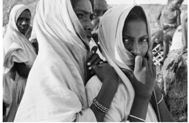
14_ Frank Horvat, Women listening to Vinoba Bhave speech, Bihar, India, 1953