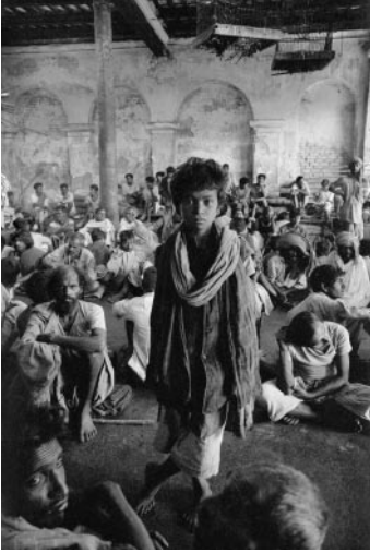
01_Frank Horvat, Beggar assembly, Calcutta, India, 1962