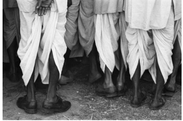
02_Frank Horvat, Calcutta, India, 1962