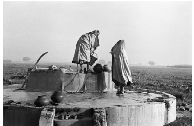
12_ Frank Horvat, Women at a village well, Punjab, India, 1952 © Frank Horvat Studio