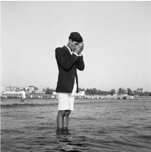
09_ Frank Horvat, Man praying, Bombay, India, 1953