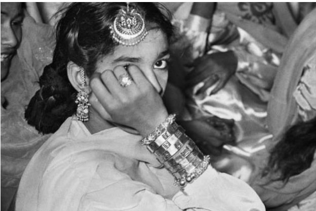
11_ Frank Horvat, Red-light district of Hira Mandi, Lahore, Pakistan, 1952