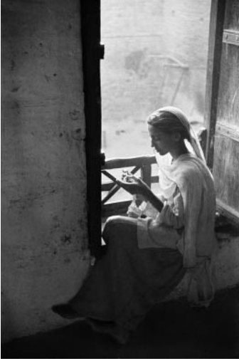
07_ Frank Horvat, Karachi, Pakistan, 1952