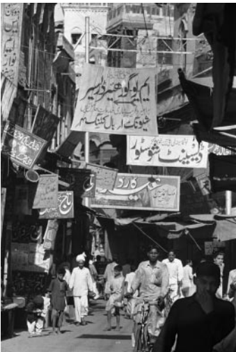
05_Frank Horvat, Bazaar, Lahore, Pakistan, 1952