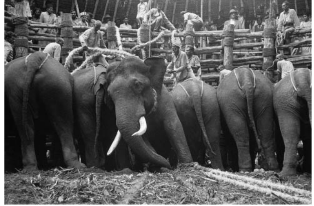
08_ Frank Horvat, Khedda, near Mysore, India, 1953